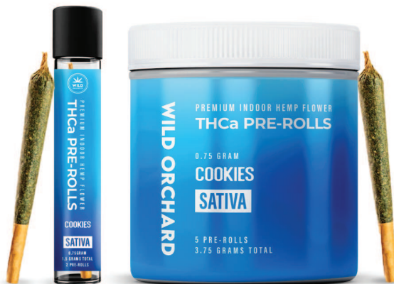
THCA PRE-ROLLS COOKIES

RPD: Relative Percent Difference between unknown sample and its duplicate LCS: Laboratory Control Sample with known concentration Case Comments: There were no divergences from ordinary Quality Control procedures or SOPs.